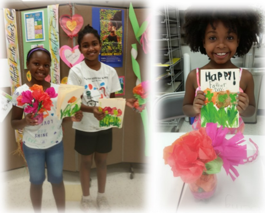
'Perfect Little Flowers', June 2016.

' Irreversible Moment ' who would have thought everyday objects could be upcycled into something beautiful...Rock Bracelets. Did you know decomposition rate of plastic water bottle is 100 years, and fabric is 40 years? To improve spatial reasoning, creativity with geometry using soft modeling clay pinch and pull, shape several ants.